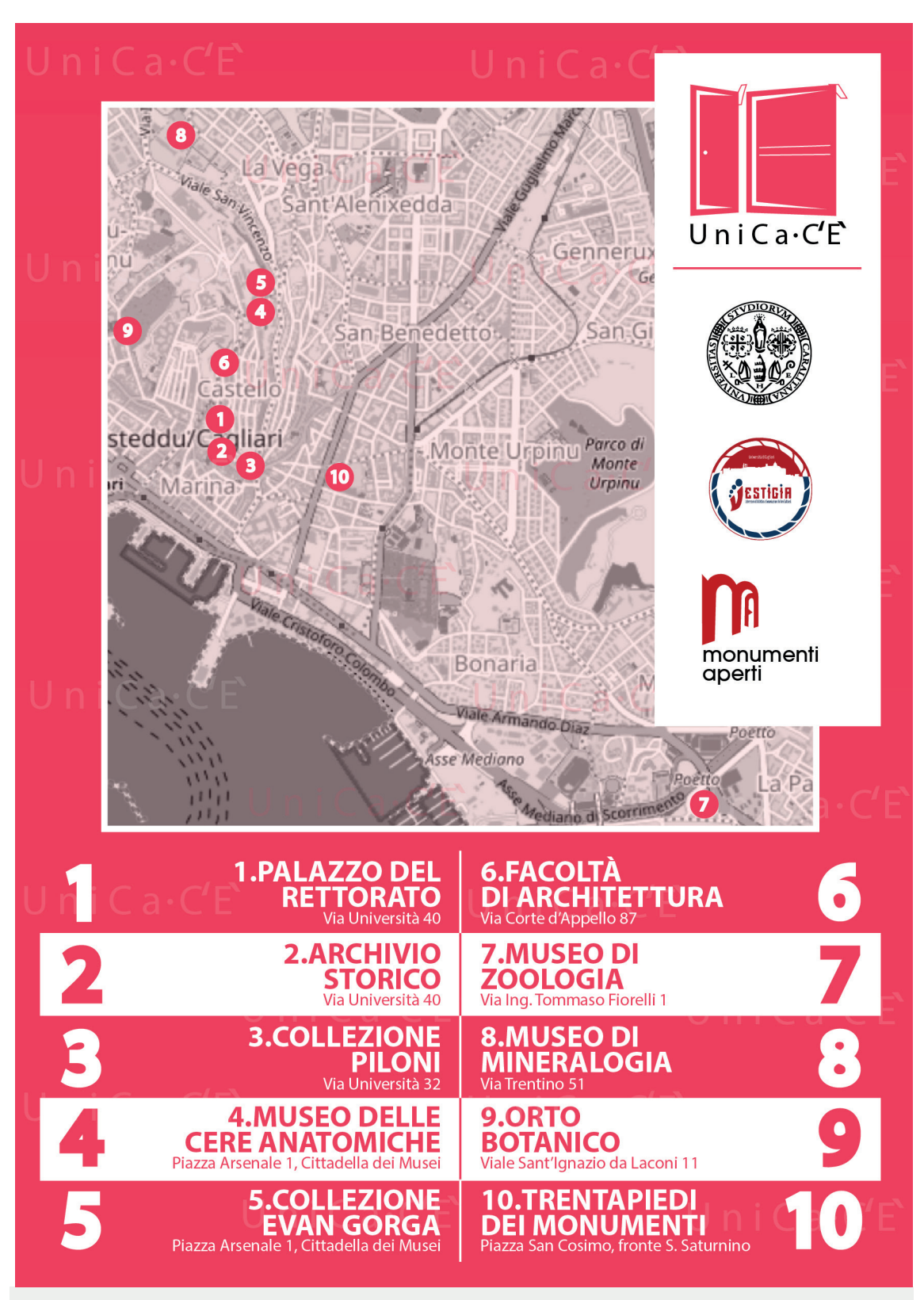
Fig. 4. Monumenti Aperti 2019, flyer that reports the map and some of the UniCa C'è network sites (the 14 sites are not opened all at once every year). Design by Francesco Mameli, Vestigia UniCa Archive