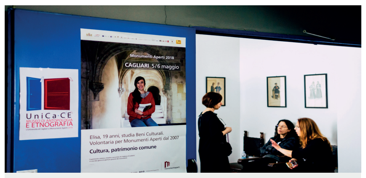
Fig. 2. University of Cagliari, Museum of Anthropology and Ethnography. A bachelor student in Cultural Heritage and Performing Arts shown in the 2018 UniCa C'è billboard.

of the Erasmus+ DELPHI European Union project (focused on Continuing Professional Development for Heritage Interpretation staff to facilitate Lifelong Learning for social inclusion and European cohesion), it aims to proactively democratise the 'valuing process' and translates core European values into heritage (DELPHI 2020).