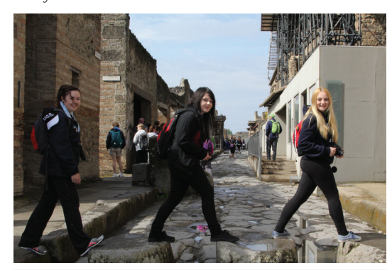
Fig. 3. Three students from Tumut High School during their tour of Pompeii.

small country town have visited Italy since the school trips started in 2003, and the cultural tours have had a big impact on the school and local community. For many Tumut High School students, who have never even visited the cities of Sydney or Canberra, the trip to Italy is a big event in their lives because it is their first time away from home and outside Australia.