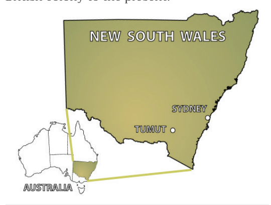
Fig. 1. Map of Australia showing the state of New South Wales (B.Wood).

Australia is comprised of six states and two territories (Figure 1), and although a new national curriculum has now been implemented for all Australian children aged 5 to 16 (ACARA 2016a), at the time of writing this article, each state is still responsible for developing its own senior secondary curriculum for students aged 16 to 18 years in the final two years of schooling. Since 2000 New South Wales has offered three senior history subjects: Ancient History, Modern History and History Extension. These courses are developed by the New South Wales Board of Studies, Training and Education Standards (BOSTES). The Cities of Vesuvius: Pompeii and Herculaneum is the core study within the subject of Ancient History and all students must answer compulsory questions on it in their final examination. In order to understand the 'Pompeii-mania' phenomenon that has emerged over the last ten years, it is necessary to briefly examine how the subject of Ancient History has developed in New South Wales since the early years of this former British colony to the present.